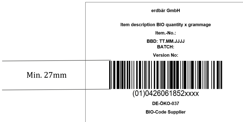
Illustration 1 – Example of a tray label

Illustration 1 shows a label for the marking of a tray. All essential and required information is included.