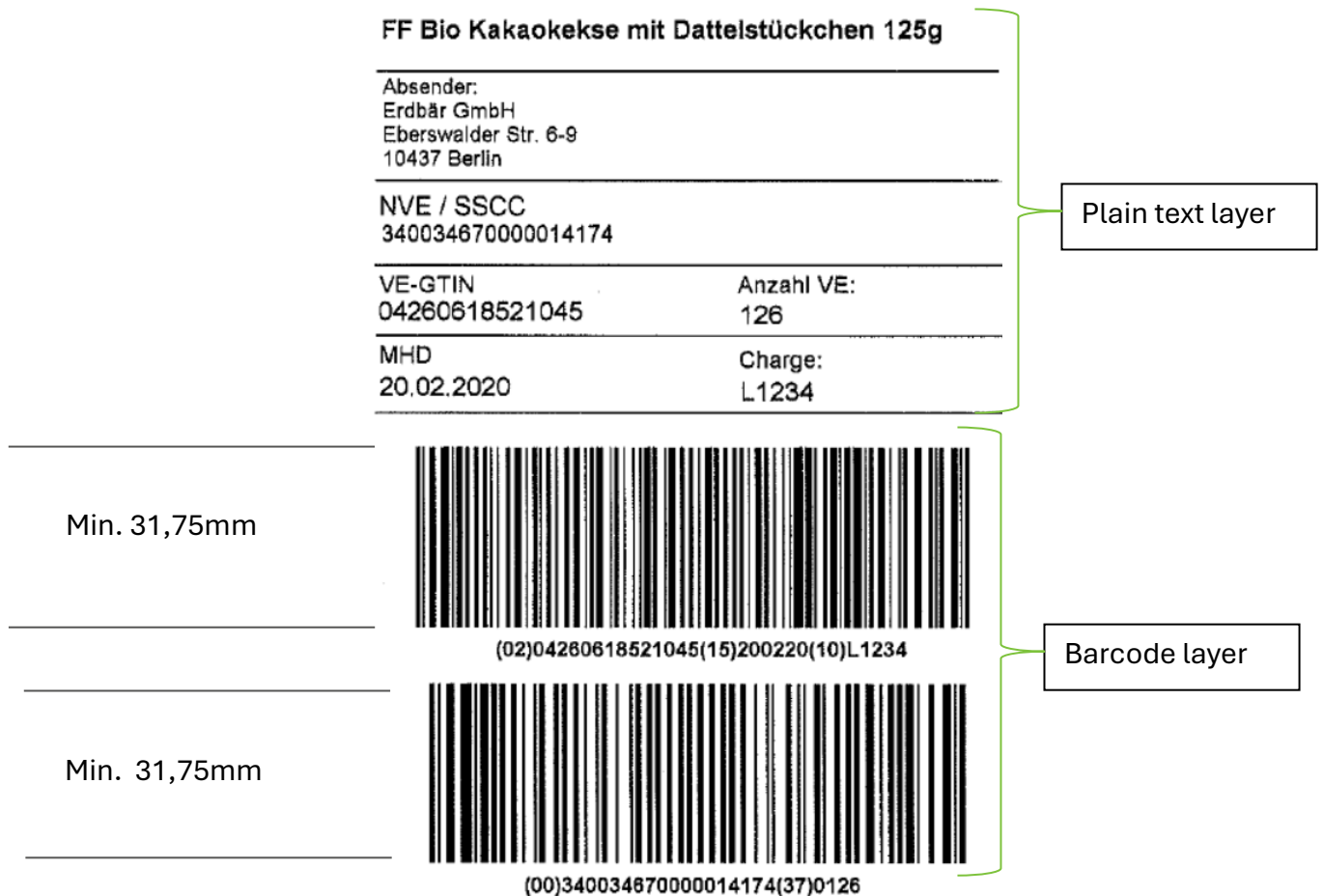
Illustration 7 - Example Structure of an SSCC Label

All barcodes must comply uniformly with the ISO 15416 international standard.