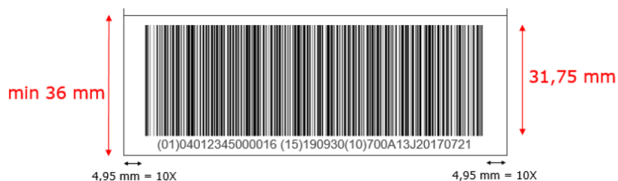
Illustration 8 – Detailed Requirements for SSCC Barcode Dimensions